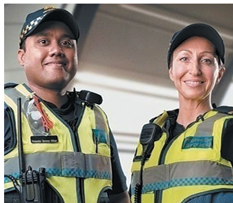
Protective Services Officers (PSO)

** Authorised officers are different to Protective Services Officers.